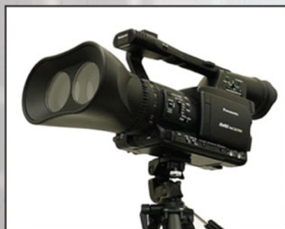
Stereoscopic 3D Rigs / Mounts using Panasonic, Sony and RED cameras and recorders